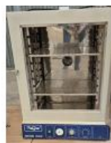
Reference: MRC-004 DRYING OVEN Year: . Brand: RAYPA Width: .