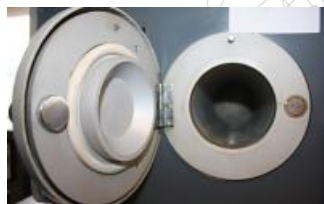
Reference: TTE-18 Beam shrinking samples with steam Year: . Brand: Wira Width: 0