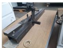
Reference: FNX2-337 CROCKMETER MANUAL Year: . Brand: ATLAS Width: .