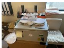
Reference: TTR-023 ABRASION TESTER TWO PLATES Year: . Brand: . Width: .