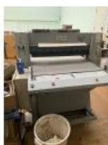
Reference: TTR-009 CUT / PINKING MACHINE 800mm Year: . Brand: BOSCH Width: .