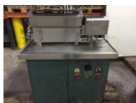
Reference: ACA-240 JIGGER Laboratory Year: . Brand: Ernst Benz Width: 500