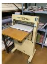
Reference: TTR-013 CUT / PINKING MACHINE 500mm Year: . Brand: PIGUILLEM Width: .