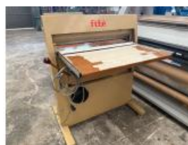
Reference: M-1731 CUT / PINKING MACHINE 820mm wi... Year: . Brand: Fite Width: 820