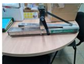
Reference: TTR-019 CROCKMETER Year: . Brand: Roaches Width: .