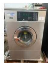
Reference: MIC-005 LABORATORY WASHING MACHINE Year: 1997 Brand: IPSO International Width: .