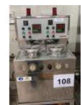
Reference: CTB-108 laboratory sample dyer for cones Year: 1993 Brand: Ugolini Width: .