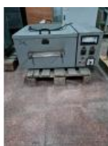
Reference: M-1712 LABORATORY STENTER Year: . Brand: Werner Mathis AG Width: .