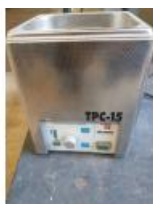
Reference: M-1590 ULTRASONICS POWER CLEANING Year: . Brand: TELSONIC Width: .