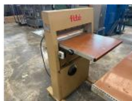
Reference: M-1732 CUT / PINKING MACHINE 500mm wi... Year: 1999 Brand: Fite Width: 500