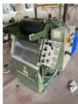
Reference: LEG-002 SQUEEZING PADDER for samples. Year: . Brand: Bianco Width: 400