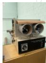
Reference: TTR-014 TEST PILLING Year: . Brand: ATLAS Width: .