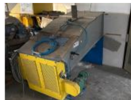
Reference: MIC-061B SIEVING UNIT Year: 2005 Brand: WERKHUIZEN SCHEPENS Width: .