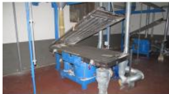
Reference: MIC-059C SIEVING UNIT Year: 2005 Brand: FUCHS Width: .