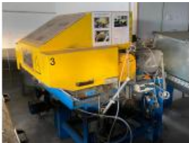
Reference: MIC-061A ROTARY CUTTER FLOCK Year: 2005 Brand: H&H Width: 432