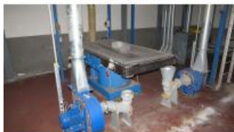
Reference: MIC-060B SIEVING UNIT Year: 2005 Brand: FUCHS Width: .