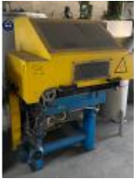
Reference: MIC-059A ROTARY CUTTER FLOCK Year: 2005 Brand: H&H Width: 432