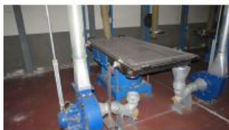
Reference: MIC-060D SIEVING UNIT Year: 2005 Brand: FUCHS Width: .