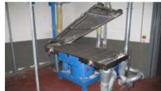
Reference: MIC-059D SIEVING UNIT Year: 2005 Brand: FUCHS Width: .