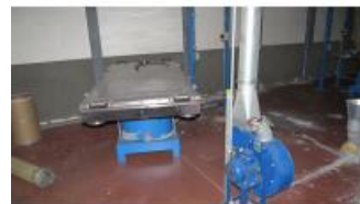
Reference: MIC-060C SIEVING UNIT Year: 2005 Brand: FUCHS Width: .