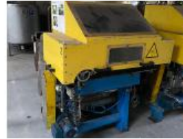
Reference: MIC-060A ROTARY CUTTER FLOCK Year: 2005 Brand: H&H Width: 432