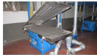
Reference: MIC-059B SIEVING UNIT Year: 2005 Brand: FUCHS Width: .