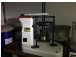
Reference: MIC-2650 TEST SIEVE SHAKER Year: . Brand: W. S. TYLER Width: .