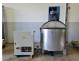
Reference: MUS-001 Preparator for Thickeners And ... Year: 2005 Brand: Fimat Width: .