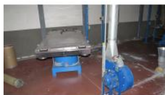
Reference: MIC-060C SIEVING UNIT Year: 2005 Brand: FUCHS Width: .