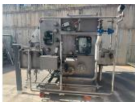
Reference: M-1670 WASHING BOX SHARK Year: . Brand: TVE Escala Width: 2000