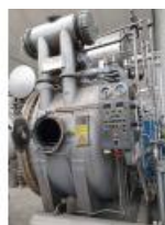
Reference: FNX2-233 Jet dyeing machine H.T. 2 ROPE Year: 2001 Brand: MCS Width: .