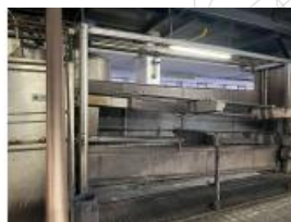
Reference: STV-005 WASHER FOR CREELS Year: . Brand: Cominox Width: 3200mm WW