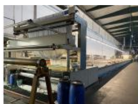
Reference: STV-002 FLAT BED PRINTING MACHINE 9 co... Year: 1995 Brand: Reggiani Width: 3200mm WW