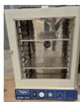
Reference: MRC-004 DRYING OVEN Year: . Brand: RAYPA Width: .