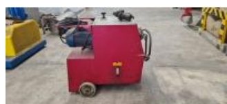
Reference: AV7-021 ROTARY HIDRAULIC UNIT Year: . Brand: Asisa Width: .