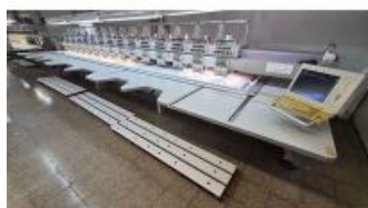
Reference: JSO-003 EMBROIDERY MACHINE 15 HEADS Year: 2005 Brand: ZSK Width: .