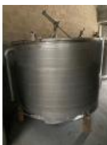
Reference: MIC-061F jacketed mix tank, 316 SS, 3... Year: 1997 Brand: LOPIK Width: .