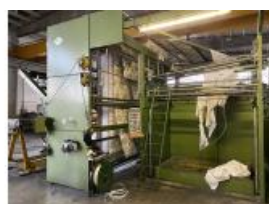
Reference: STV-015 FOLDING MACHINE AND PALLETIZIN... Year: 1992 Brand: LAZZATI FRANCO Width: 3600mm