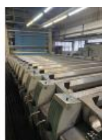
Reference: STV-004 ROTARY PRINTING MACHINE 13 COL... Year: 1997 Brand: Reggiani Width: 3200mm WW