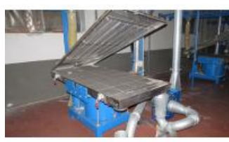
Reference: MIC-059B SIEVING UNIT Year: 2005 Brand: FUCHS Width: .