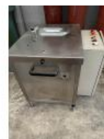
Reference: M-1714 UNSTITCHING MACHINE Year: . Brand: Bianco Width: .