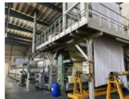
Reference: STV-008 STENTER 7 CHAMBERS 3400mm Year: 1990 Brand: Reggiani Width: 3400mm