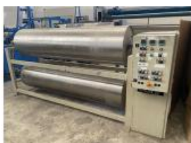
Reference: F-6727 WUMAG water-cooled drums ( 2 c... Year: 1993 Brand: Wumag Width: 2400