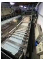
Reference: STV-003 ROTARY PRINTING MACHINE 9 COLO... Year: 1995 Brand: Reggiani Width: 3200mm WW