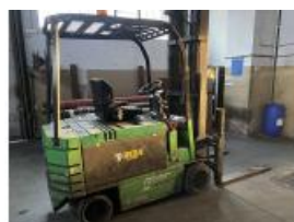
Reference: STV-021 ELECTRIC FORK LIFT 3000kg Year: . Brand: CESAB Width: .