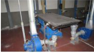
Reference: MIC-060D SIEVING UNIT Year: 2005 Brand: FUCHS Width: .