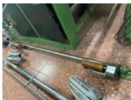
Reference: CCTT-055 GUIDING DEVICE Year: . Brand: E+L Width: .