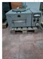
Reference: M-1712 LABORATORY STENTER Year: . Brand: Werner Mathis AG Width: .