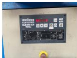
Reference: STV-016 SCREW COMPRESSOR 55kw Year: 1998 Brand: MARK Width: .