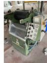
Reference: LEG-002 SQUEEZING PADDER for samples. Year: . Brand: Bianco Width: 400