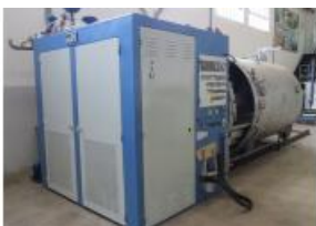
Reference: SAS-017 Jigger high temperature RENEWED Year: 1982 Brand: MCS Width: 2600