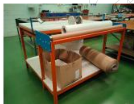
Reference: TTR-003 INSPECTING TABLE WITH COUNTER Year: . Brand: . Width: 1800