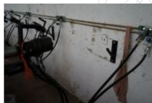
Reference: CCTT-045 ROTATING STATION 6 POINTS Year: . Brand: MENZEL Width: .