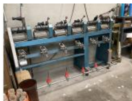
Reference: TTR-041 WINDER 6 cones Year: . Brand: Motocono Width: .