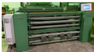
Reference: FNX2-268 WEFTSTRAIGHTENER Year: 2000/2008 Brand: BIANCO/CORINO Width: 2000