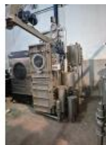
Reference: AV7-004 JET ATMOSPHERIC 15kg Year: 1998 Brand: Minox Width: .