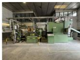
Reference: AV7-009 SANFORISING MACHINE FOR FABRIC... Year: 1995 Brand: MUZZI Width: 2000