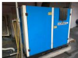
Reference: STV-017 SCREW COMPRESSOR 55kw Year: 1995 Brand: MARK Width: .