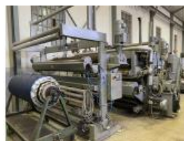
Reference: TES-001 SANFORISING MACHINE Year: 1991 Brand: Monforts Width: 2100