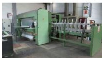
Reference: MTB-025 PACKING MACHINE Year: 1991 Brand: Tapalsa Width: 2400