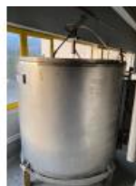
Reference: MIC-061E jacketed mix tank, 316 SS, 1.5... Year: 1997 Brand: LOPIK Width: .