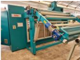
Reference: M-1694 STABILIZATION MACHINE WITH FEL... Year: 2011 Brand: Lafer Width: 2400