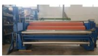
Reference: CCMA-001 FINISHING PADDER Year: 2002 Brand: Bruckner Width: 3200