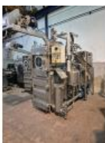
Reference: AV7-005 JET ATMOSPHERIC 30kg Year: 1999 Brand: COMIX Width: .