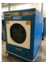
Reference: ATG-006 DRYER 30kg Year: 1998 Brand: Maino Inox Width: .