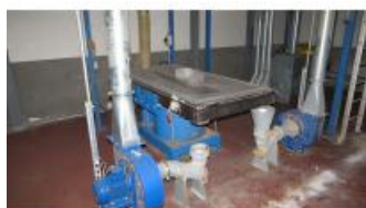
Reference: MIC-060B SIEVING UNIT Year: 2005 Brand: FUCHS Width: .