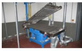
Reference: MIC-059D SIEVING UNIT Year: 2005 Brand: FUCHS Width: .