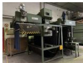
Reference: AV7-013 PREPARATION MACHINE Year: 1998 Brand: Corino Width: 2000