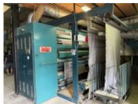
Reference: AV7-012 SHEARING MACHINE Year: 1991 Brand: Lafer Width: 2000