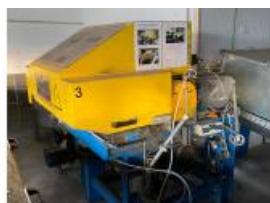
Reference: MIC-061A ROTARY CUTTER FLOCK Year: 2005 Brand: H&H Width: 432