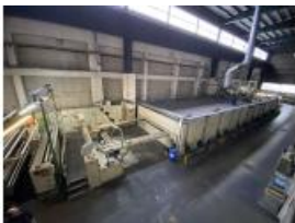
Reference: STV-009 STENTER 6 CHAMBERS of 4 meters... Year: 2001 Brand: Reggiani Width: 3400mm