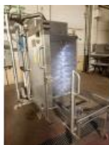
Reference: MRC-002 DYEING CABINET Year: 2007 Brand: GRANDIS Width: .