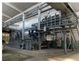
Reference: TFN-013 WASHING MACHINE OPEN WIDTH Year: 1998 Brand: CIMI Width: 2000