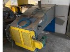
Reference: MIC-061B SIEVING UNIT Year: 2005 Brand: WERKHUIZEN SCHEPENS Width: .