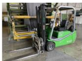
Reference: STV-018 ELECTRIC FORK LIFT 2000kg Year: 2003 Brand: CESAB Width: .