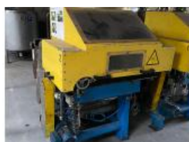
Reference: MIC-060A ROTARY CUTTER FLOCK Year: 2005 Brand: H&H Width: 432