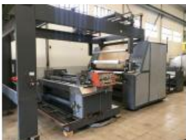
Reference: M-1626 STORK Coating Line Roller Width... Year: 1989 Brand: Stork Width: 2000