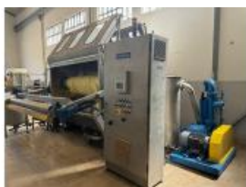
Reference: AV7-008 JIGGER ELECTRONIC D1300 Year: 2002 Brand: TVE Escalé Width: 2200