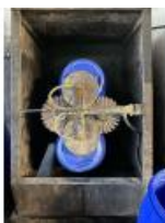
Reference: STV-007 WASHER FOR COLOUR CUBE Year: . Brand: Colombo Width: .