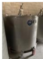
Reference: MIC-059E jacketed mix tank, 316 SS, 1.5... Year: 1997 Brand: LOPIK Width: .