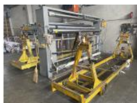
Reference: STV-001 PREPARATION MACHINE FOR A-FRAME Year: . Brand: . Width: 3400mm