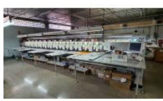
Reference: JSO-001 EMBROIDERY MACHINE 12 HEADS Year: 2005 Brand: SWF Width: .