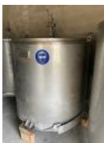
Reference: MIC-060E jacketed mix tank, 316 SS, 1.5... Year: 1997 Brand: LOPIK Width: .