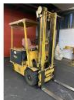
Reference: STV-019 ELECTRIC FORK LIFT 2000kg Year: . Brand: CESAB Width: .