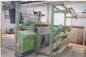
Reference: FNX2-216 Squeezing and finishing padder Year: 1999 Brand: Artos Width: 2000