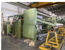
Reference: STV-012 INSPECTION AND ROLLING MACHINE... Year: 1988 Brand: LAZZATI FRANCO Width: 3200mm