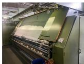
Reference: STV-013 INSPECTION AND ROLLING MACHINE... Year: 1989 Brand: LAZZATI FRANCO Width: 3200mm