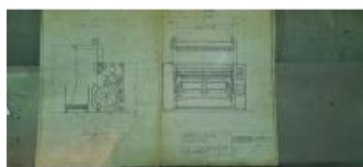
Reference: M-1719 NEEDLE WHEEL WEFT STRAIGHTENER Year: 1986 Brand: Corino Width: 2000