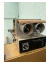
Reference: TTR-014 TEST PILLING Year: . Brand: ATLAS Width: .