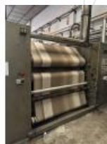
Reference: AV7-011 DECATIZING CONTINUOUS MACHINE Year: 1987 Brand: Sperotto Rimar Width: 1900