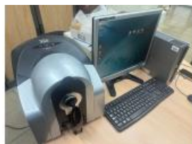
Reference: MRC-003 DATACOLOR 400 COMPLETE Year: 2008 Brand: Datacolor Width: .