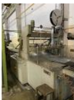
Reference: STV-014 PACKING RETRACTILE MACHINE Year: 1990 Brand: IMPACK Width: .