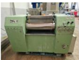
Reference: M-1699 THREE-CYLINDER REFINER Year: 1988 Brand: TALLERES MIRALLES Width: .