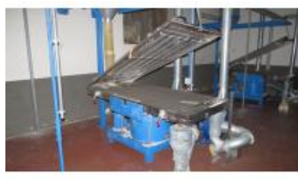
Reference: MIC-059C SIEVING UNIT Year: 2005 Brand: FUCHS Width: .