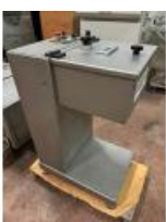
Reference: M-1713 UNSTITCHING MACHINE Year: 2001 Brand: Corino Width: .