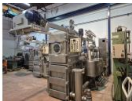
Reference: AV7-003 JET ATMOSPHERIC 100kg Year: 1999 Brand: COMIX Width: .