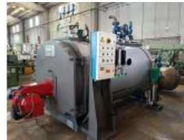
Reference: AV7-014 STEAM BOILER 1750kg Year: 2016 Brand: PERELLÓ I.VAR Width: .