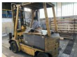
Reference: STV-020 ELECTRIC FORK LIFT 4000kg Year: 1989 Brand: CESAB Width: .