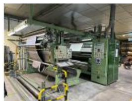
Reference: M-1709 SHEARING & CLEANING MACHINE Year: 1990 Brand: Torres Maquinaria T xtil Width: 3000