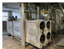
Reference: STV-006 WASHER FOR 4 CREELS Year: . Brand: Cominox Width: 3200mm WW