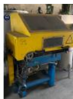
Reference: MIC-059A ROTARY CUTTER FLOCK Year: 2005 Brand: H&H Width: 432