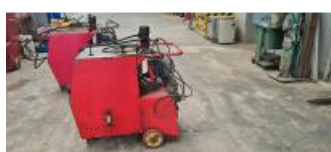
Reference: AV7-020 ROTARY HIDRAULIC UNIT Year: . Brand: Asisa Width: .