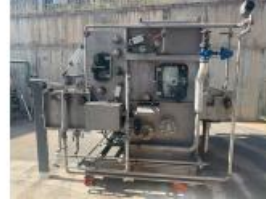
Reference: M-1670 WASHING BOX SHARK Year: . Brand: TVE Escale Width: 2000