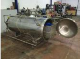
Reference: M-1161 Steamer Year: 2004 Brand: CCMT Width: 0