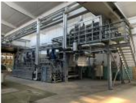
Reference: TFN-013 WASHING MACHINE OPEN WIDTH Year: 1998 Brand: CIMI Width: 2000